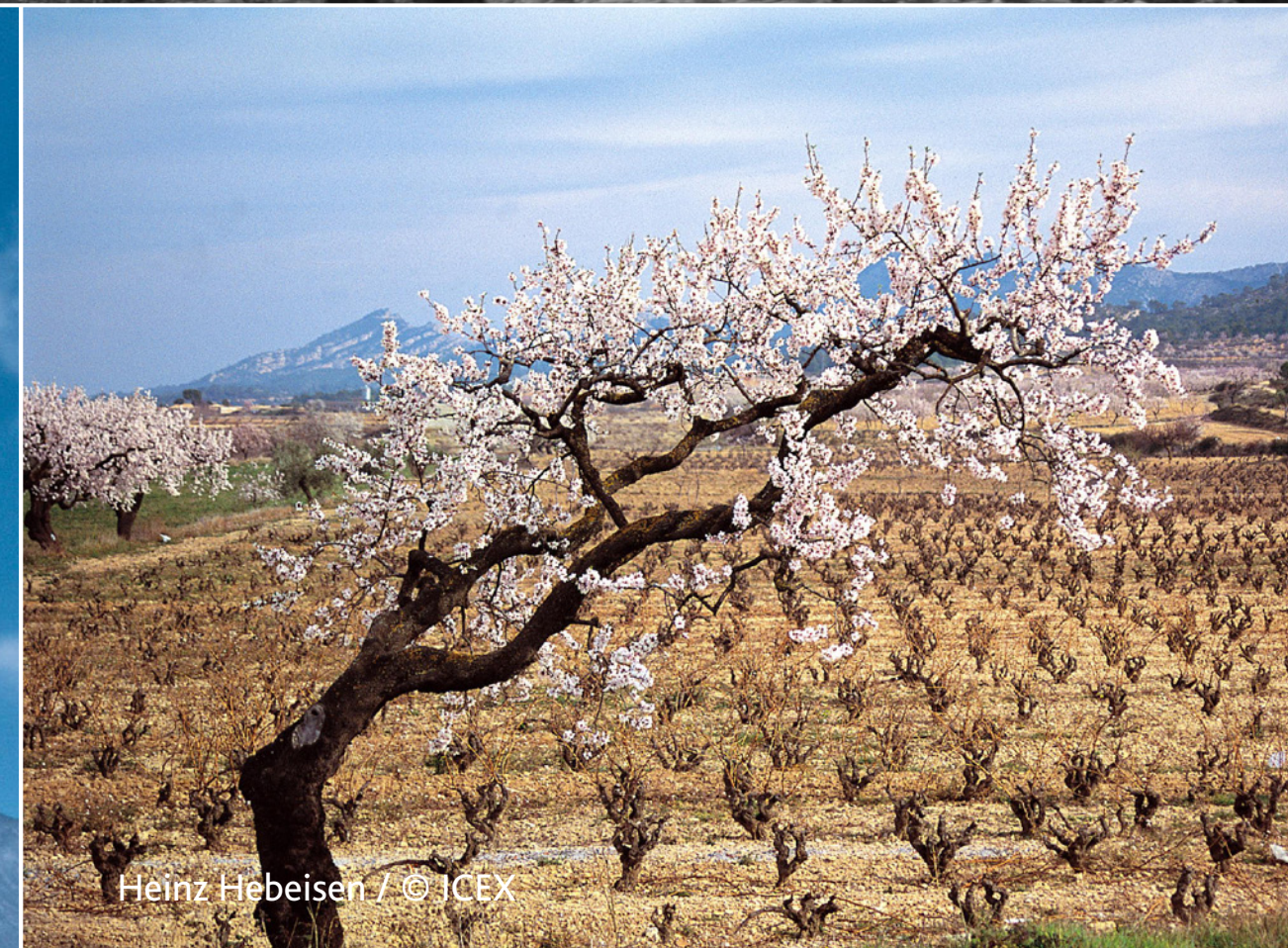
Heinz Hebeisen / © ICEX