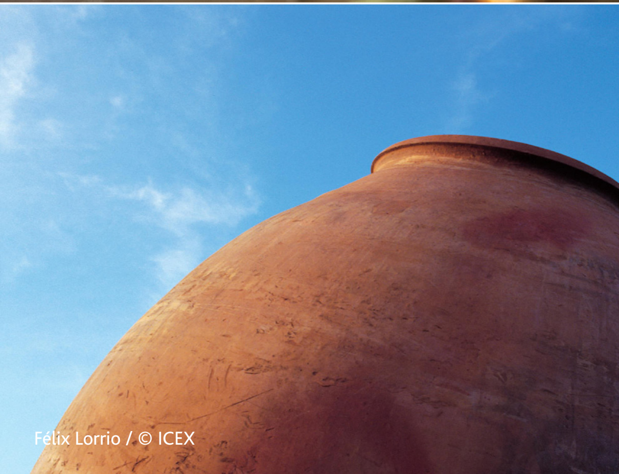
Félix Lorrio / © ICEX